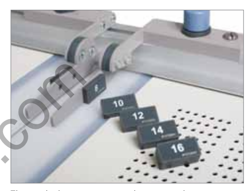
The quick-change spacers make it easier than ever to adjust the gap between the cover boards and the spine stick.